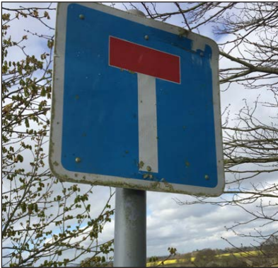
a. Five Lanes

12. Where would you find these no-through-road signs?