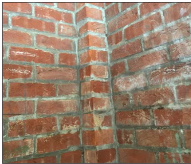
b. Bus Shelter, The Butts