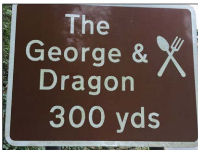
b. Eastwell Road