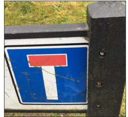
c. Mead Close