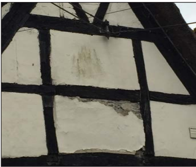
a. Old Post Office, cnr of High Street/Coxhill Lane