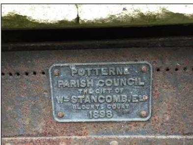
a. Adjacent to pump, Potterne Wick