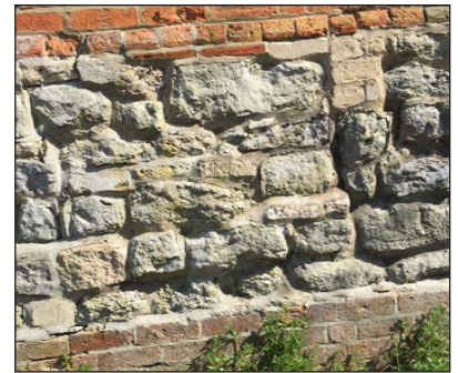
c. Potterne school (Whistley Road elev'n)