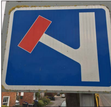
b. Duck Street