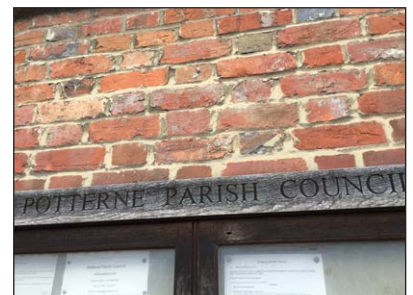
c. High Street