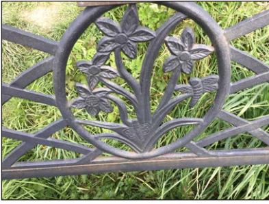
a. "Major's Seat" Adjacent byway, Furzehill Lane